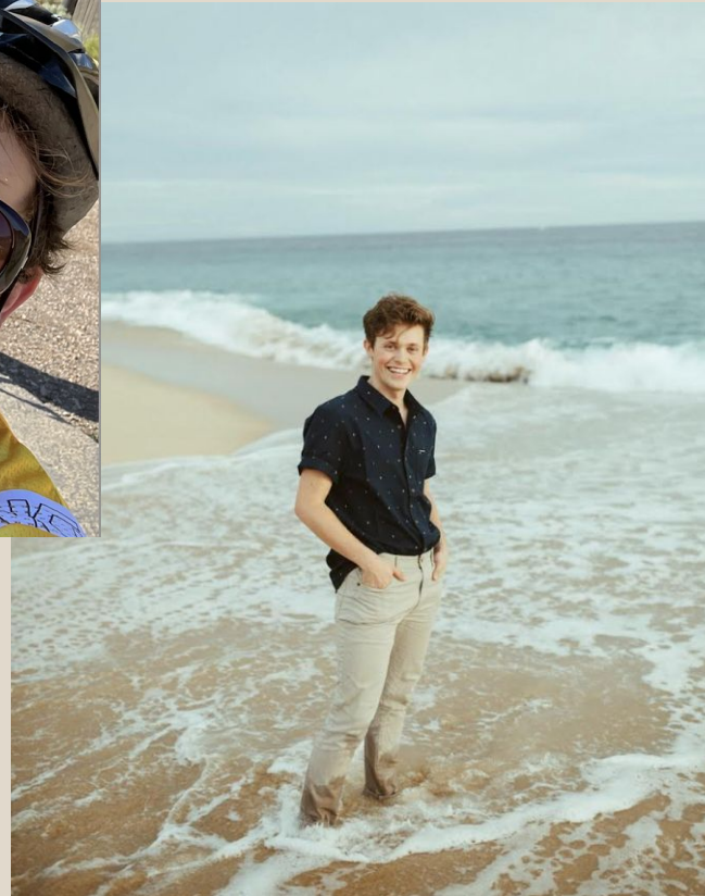
Dallin Hatch Elementary Custodian