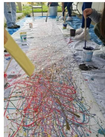
4th and 5th grade exploration of art and science.