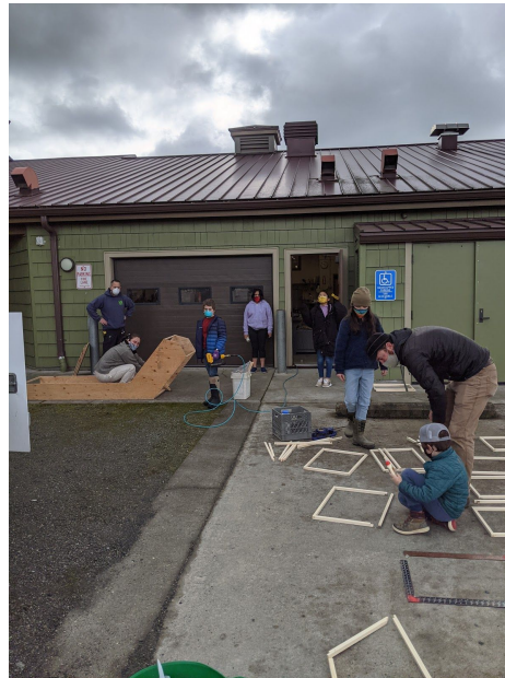
Progress on Solar Dehydrator