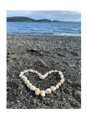
Happy Valentine's Day, Happy Mid-Winter Break, and Happy Friday!

This 2nd grade Paleontologist has been studying the Cretaceous period. We had an amazing field trip: "We visited a friend and got to see and touch actual dinosaur bones."